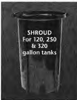
SHROUD For 120, 250 & 320 gallon tanks