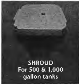
SHROUD For 500 & 1,000 gallon tanks