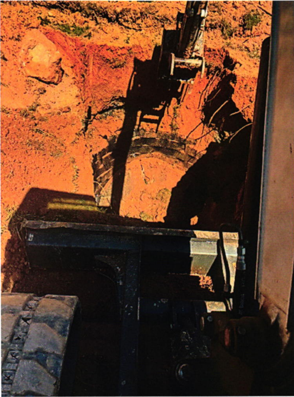
Abendori-s dry well