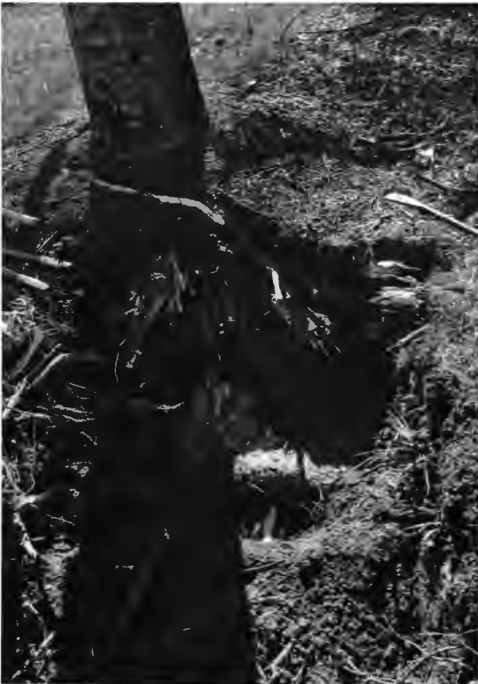
D-bix located under Cherry tree