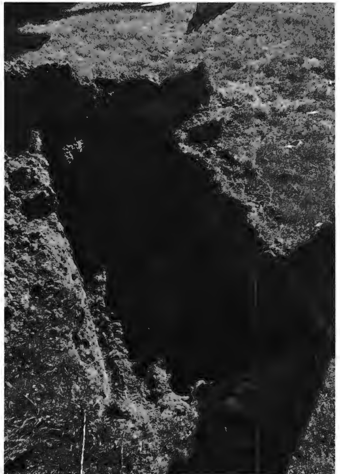
Trench #2 - Visible standing water