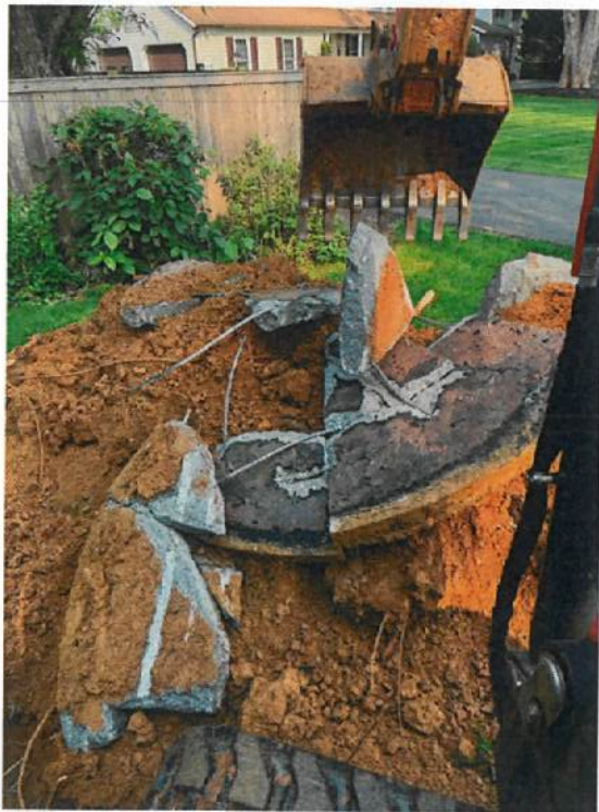
6/3/2025- Drywell Abandoned by Installer. SP