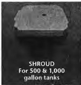
SHROUD For 500 & 1,000 gallon tanks