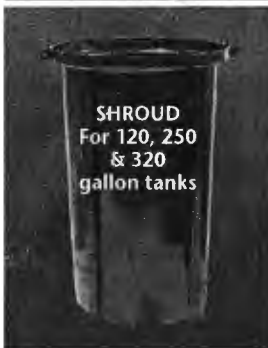
SHROUD For 120, 250 & 320 gallon tanks