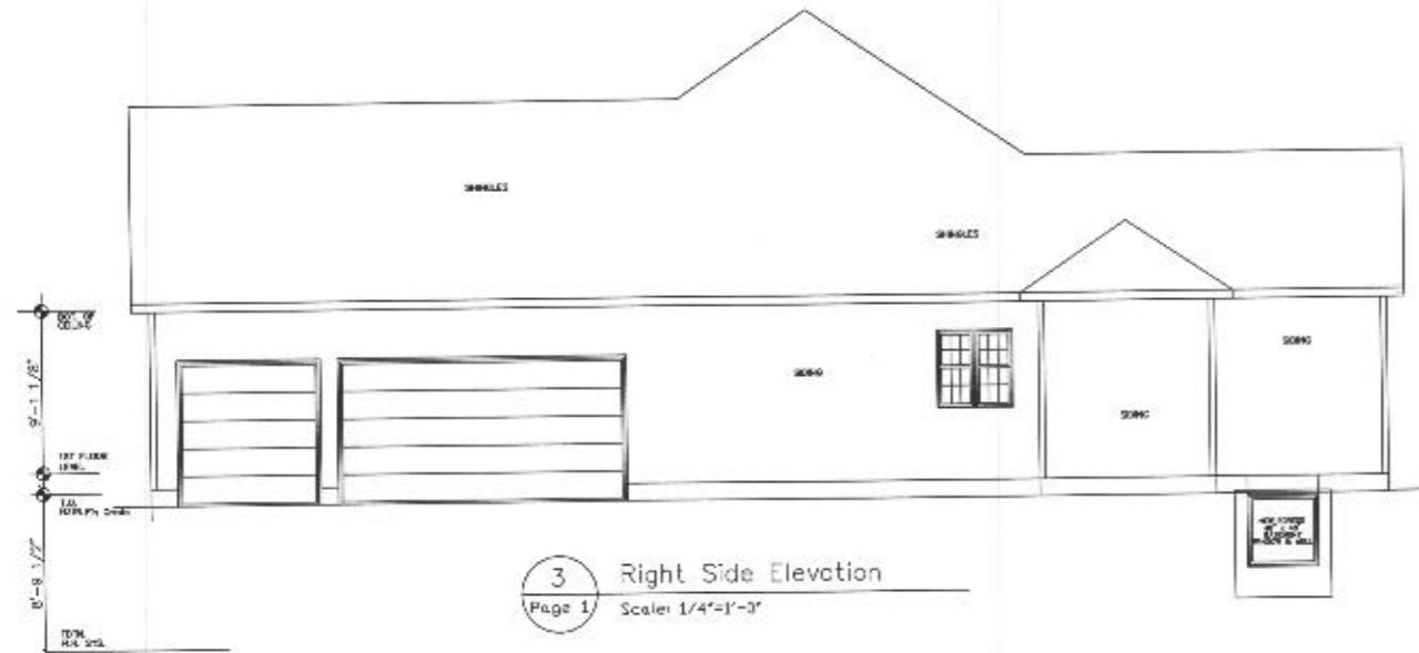
3 Right Side Elevation Page 1 Scale: 1/4"=1'-0"