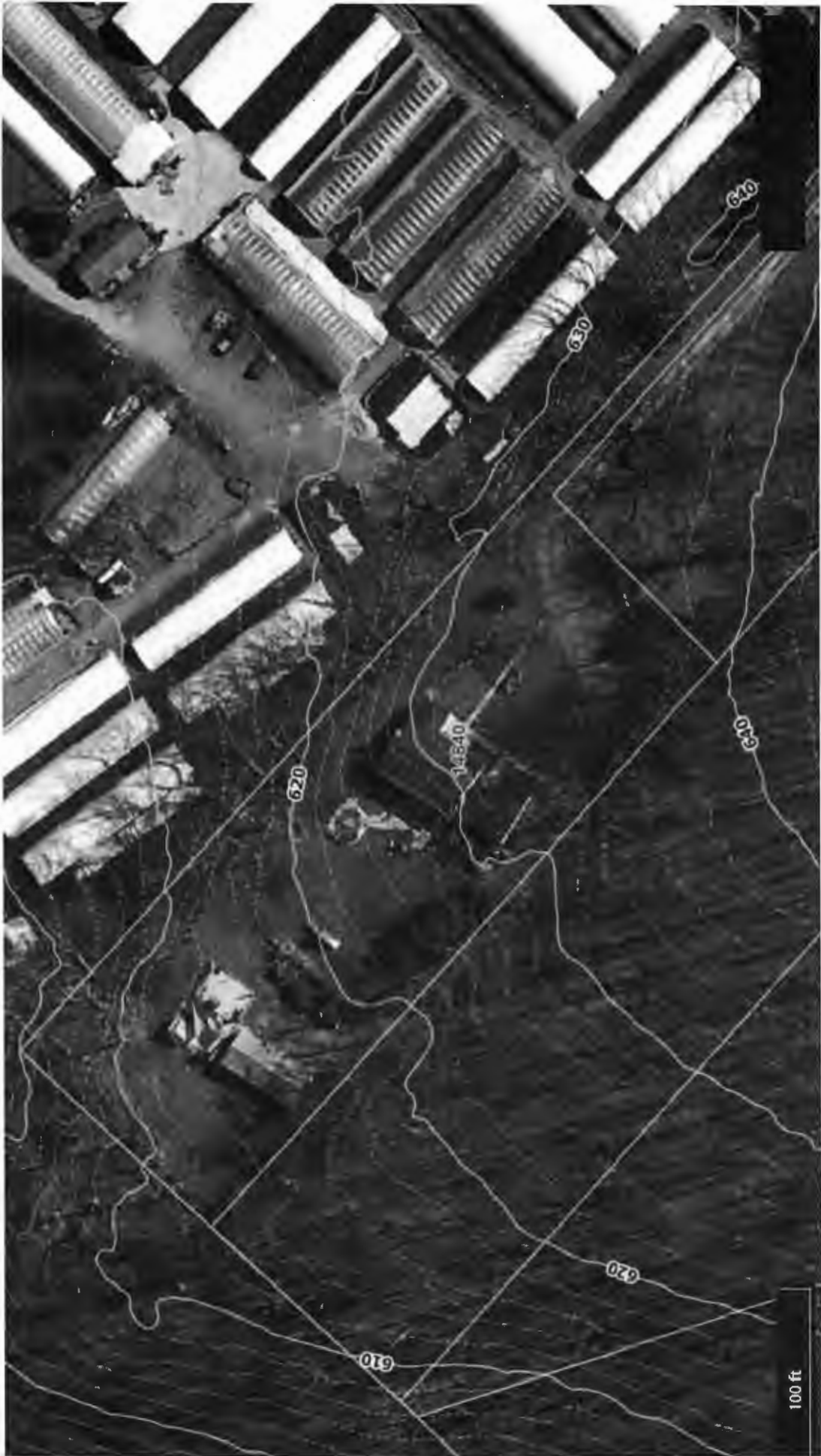
Built 1975 No Sub Room for 3 replacements