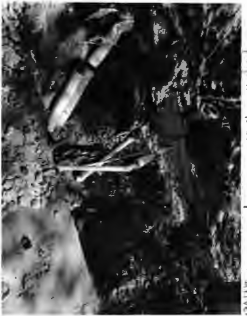
pipe to be bedded w/ stone at driveway