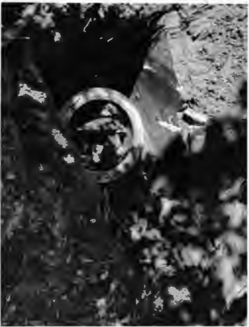
→ sleeve under driveway