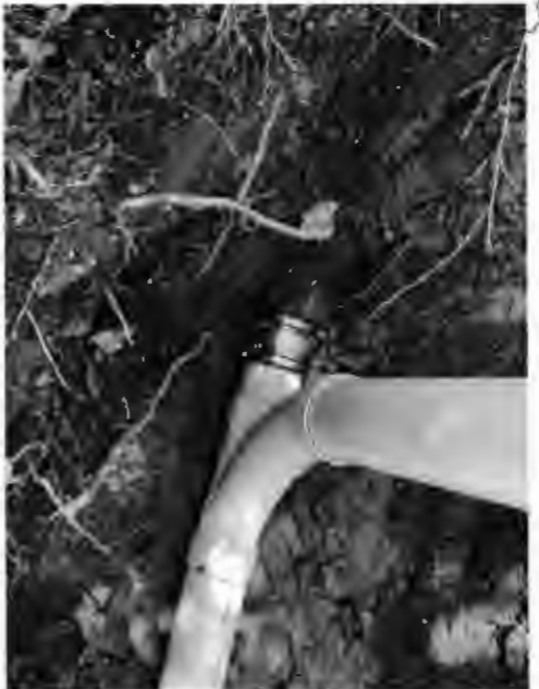
→ Connection into existing sewer line coming out of the house