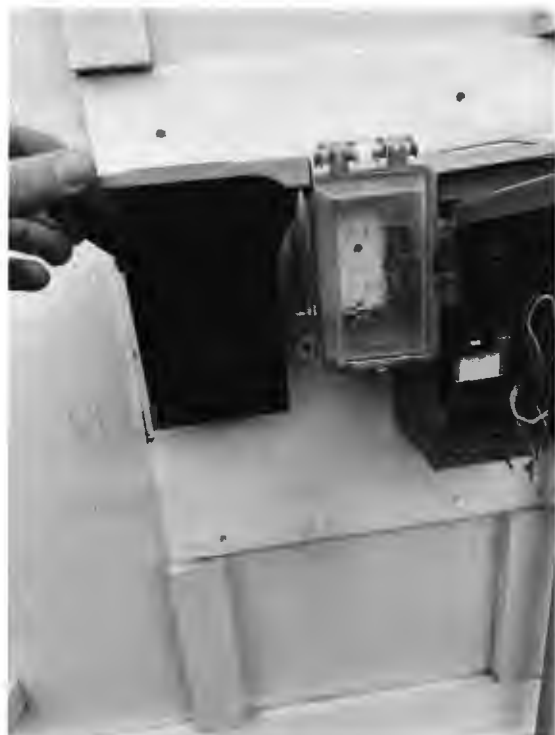
3/15/2024 - 2 Breakers installed for septic p & A system