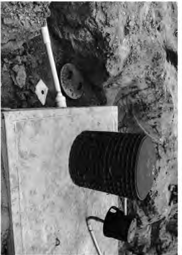
8/28/23 - pump tank install