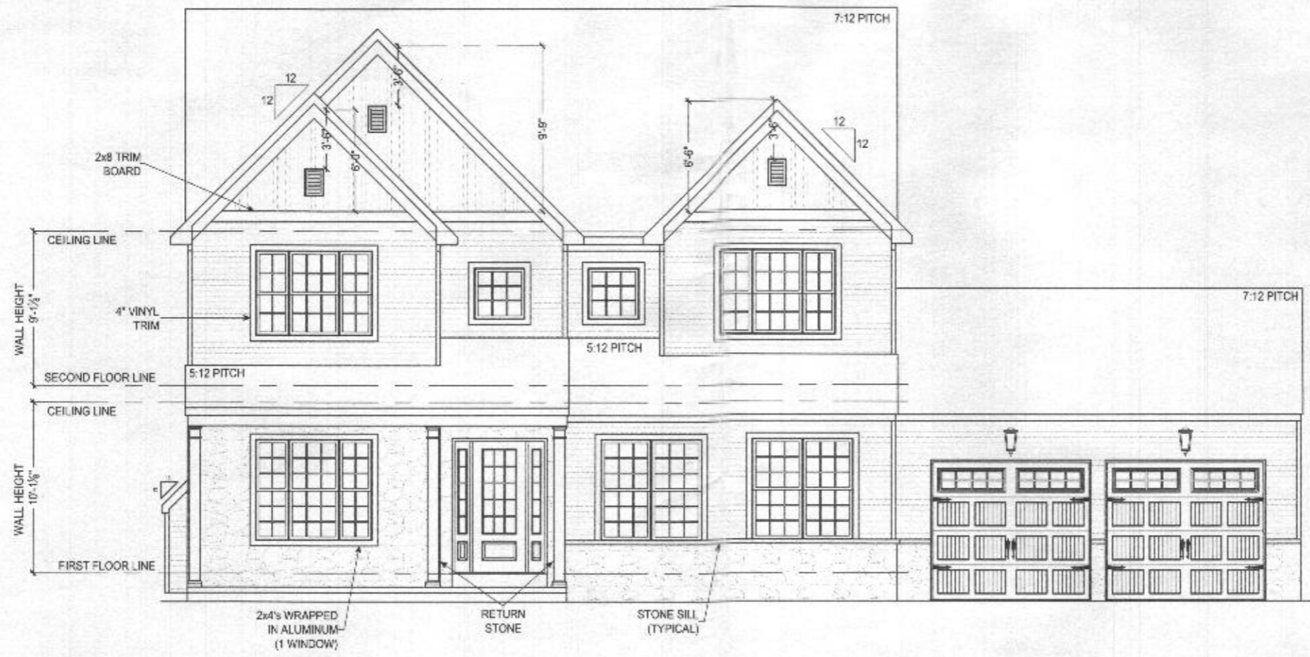
FRONT ELEVATION SCALE: 1/8" = 1'-0"

The architect, design, drawings, and content of this plan is the property of Keystone Custom Homes. It is not to be reproduced, stored, or transmitted in any form or by any means, electronic, mechanical, photocopying, recording, or by any information storage and retrieval system, without the prior written permission of Keystone Custom Homes. All rights reserved. This drawing is not to be used for any other project without the prior written permission of Keystone Custom Homes. All rights reserved. This drawing is not to be used for any other project without the prior written permission of Keystone Custom Homes. All rights reserved.