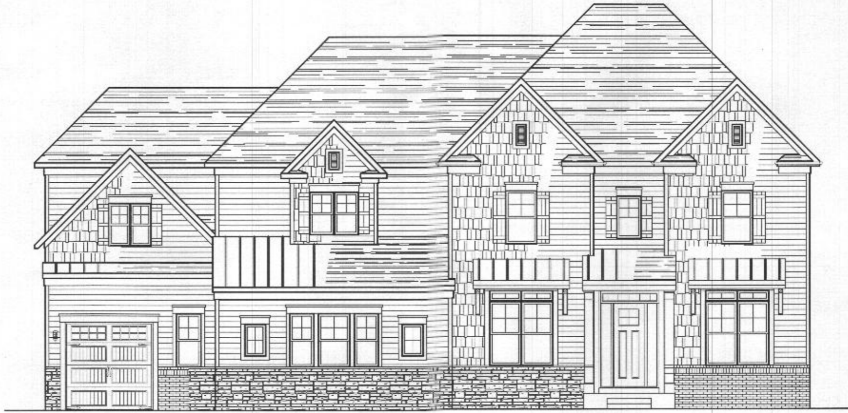
FRONT ELEVATION #3 BRICK or STONE BASE STD. SHINGLES | OPT. METAL ROOF

© David B. Robbins expressly reserves his copyright and other property rights in these plans and drawings. These plans and drawings are not to be reproduced in any form or manner without written consent.