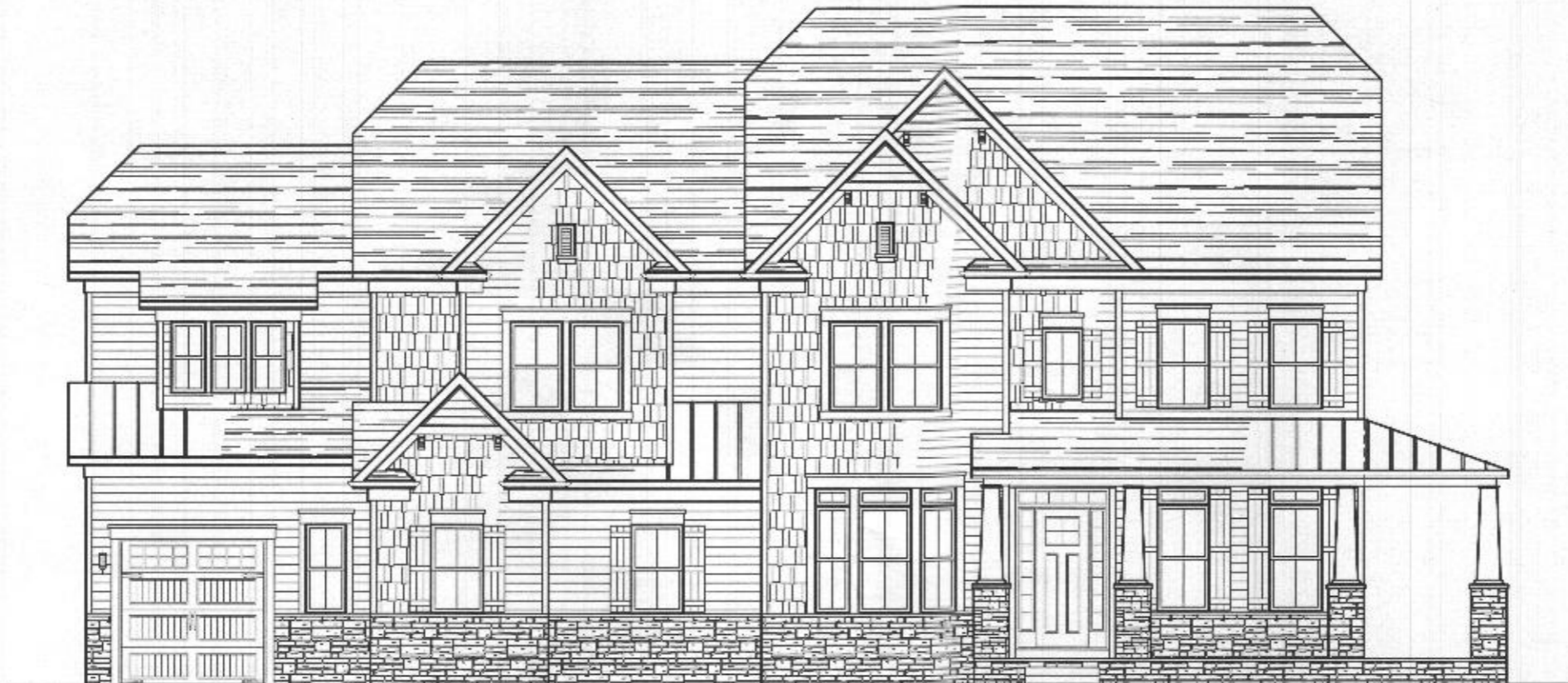
FRONT ELEVATION #2C SHOWN w/ OPT. WRAP AROUND PORCH STONE BASE w/ SIDING ABOVE STD. SHINGLES | OPT. METAL ROOF STD. HORIZONTAL SIDING | OPT HORIZONTAL & SHAKE SIDING

Architecture Collaborative, Inc. 8334 Main Street Ellicott City, MD 21043 www.archcoll.com Tel: (410) 465-7500 Fax: (410) 465-0903