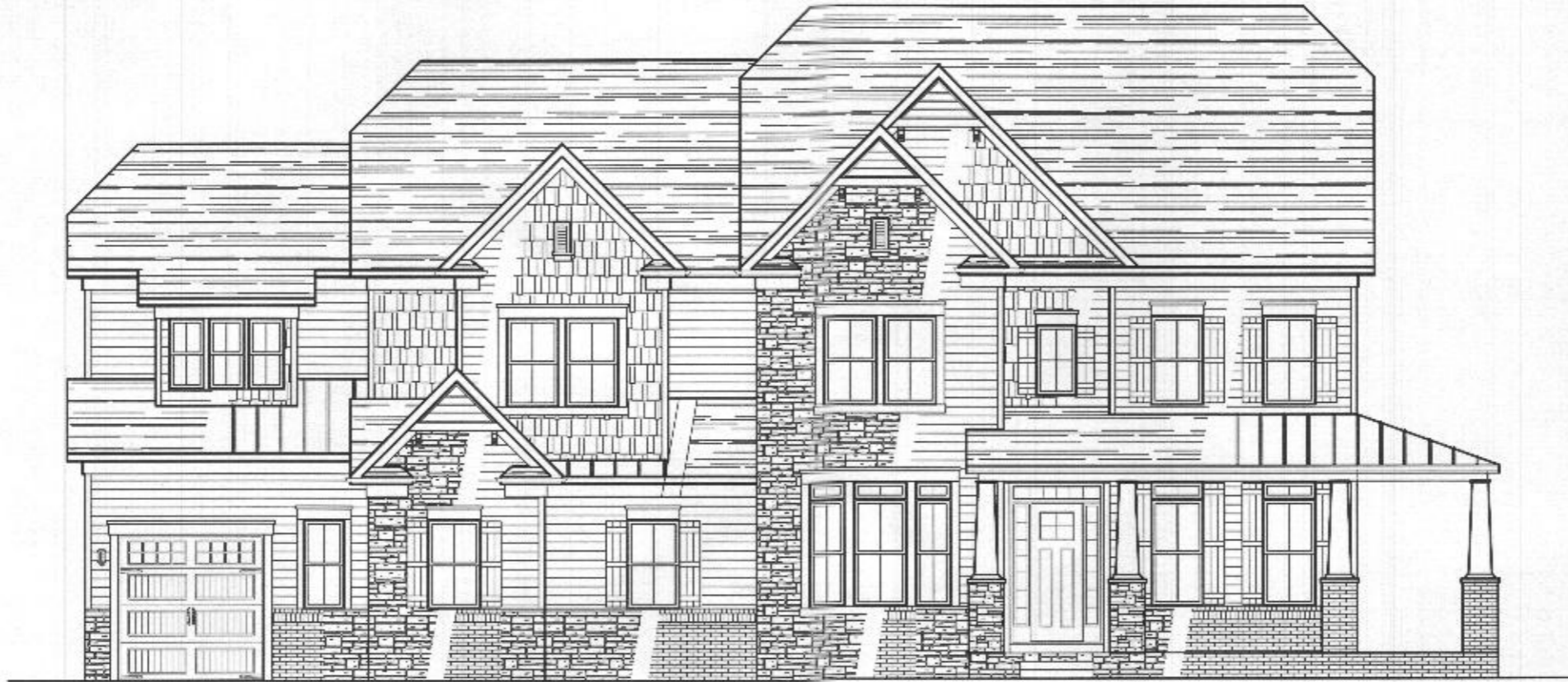
FRONT ELEVATION #2A SHOWN w/ OPT. SECOND FLOOR & OPT. WRAP AROUND PORCH BRICK or STONE BASE STD. SHINGLES | OPT. METAL ROOF

© David H. Robbins Agency reserves his copyright and other property rights in these plans and drawings. These plans and drawings are not to be reproduced in any form or manner without written consent.