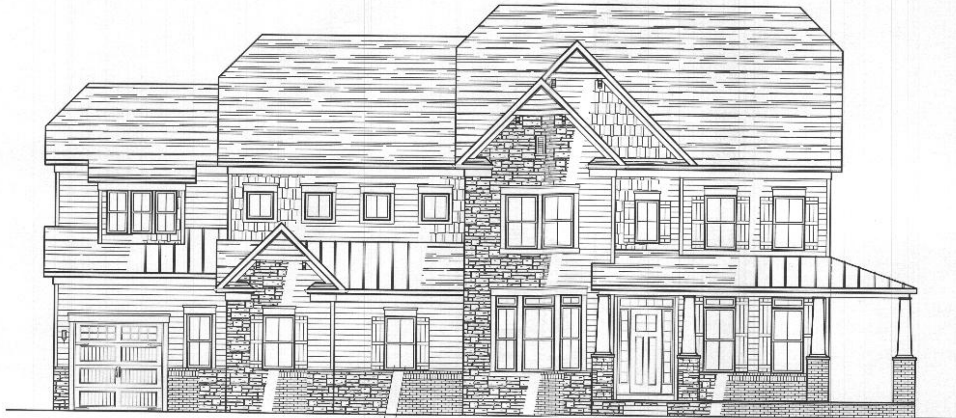
FRONT ELEVATION #2 SHOWN w/ OPT. WRAP AROUND PORCH BRICK or STONE BASE STD. SHINGLES | OPT. METAL ROOF

© David E. Robbins expressly reserves his copyright and other property rights in these plans and drawings. These plans and drawings are not to be reproduced in any form or manner without written consent.