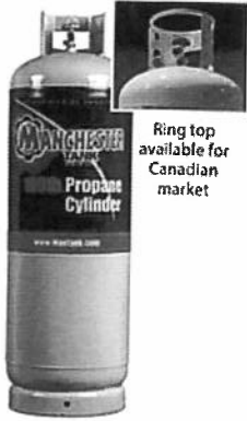
100 LB (POL VALVE)