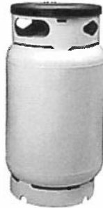
28.6 GALLON ASME Manchester's 'MINI'