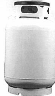
57 GALLON ASME 200 LB DOT