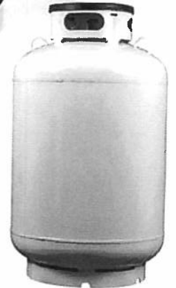
118 GALLON ASME 420 LB DOT