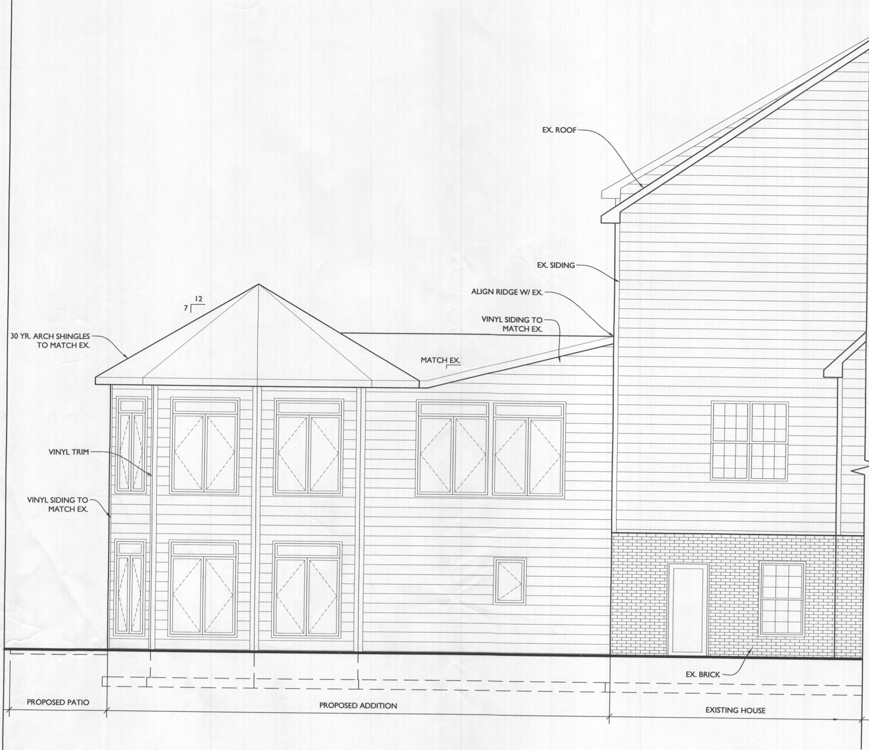
1 SIDE ELEVATION A200 SCALE: 1/4"=1'-0"