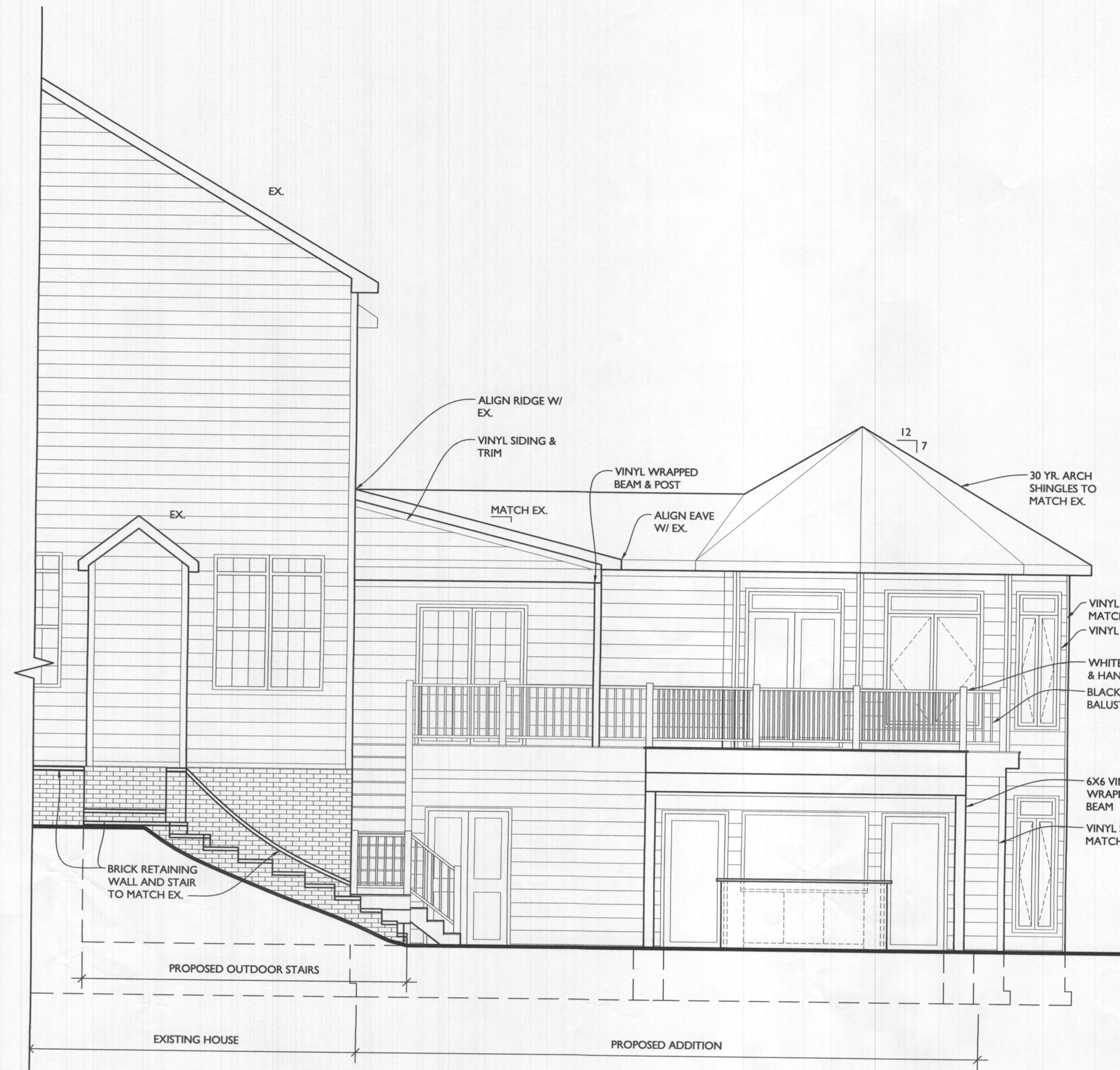
2 SIDE ELEVATION A200 SCALE: 1/4"=1'-0"