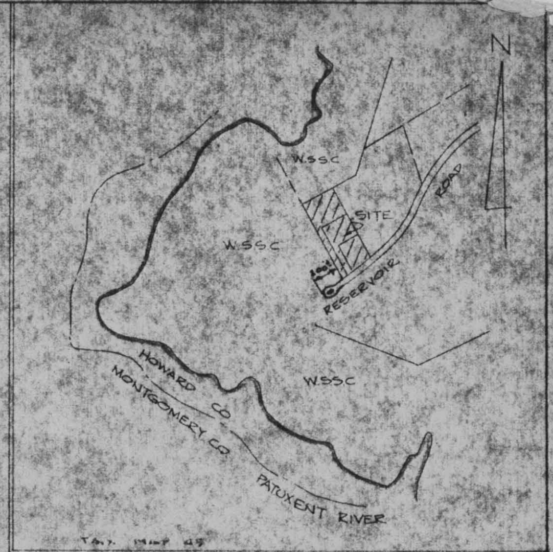
LOCATION MAP SCALE: 1" = 800'

WASHINGTON SUBURBAN SANITARY COMMISSION 229-55