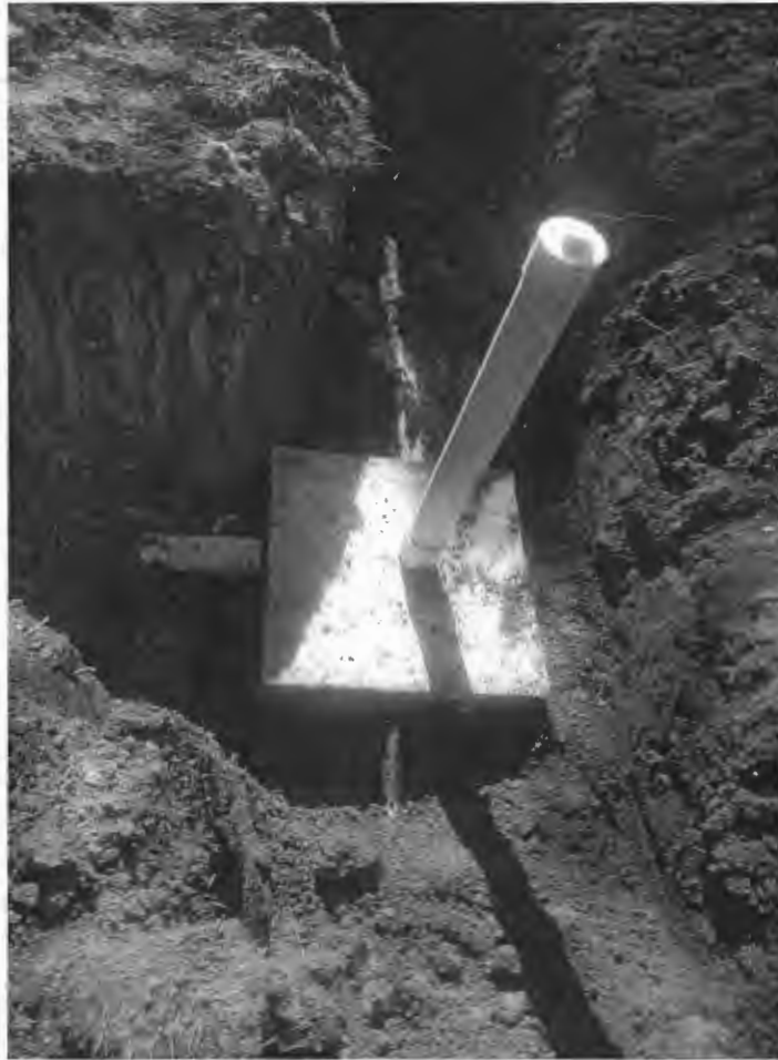
Pictures above of new installed (larger) distribution box from Mayer Bro's Inc. Installed 5/16/19. -KMW