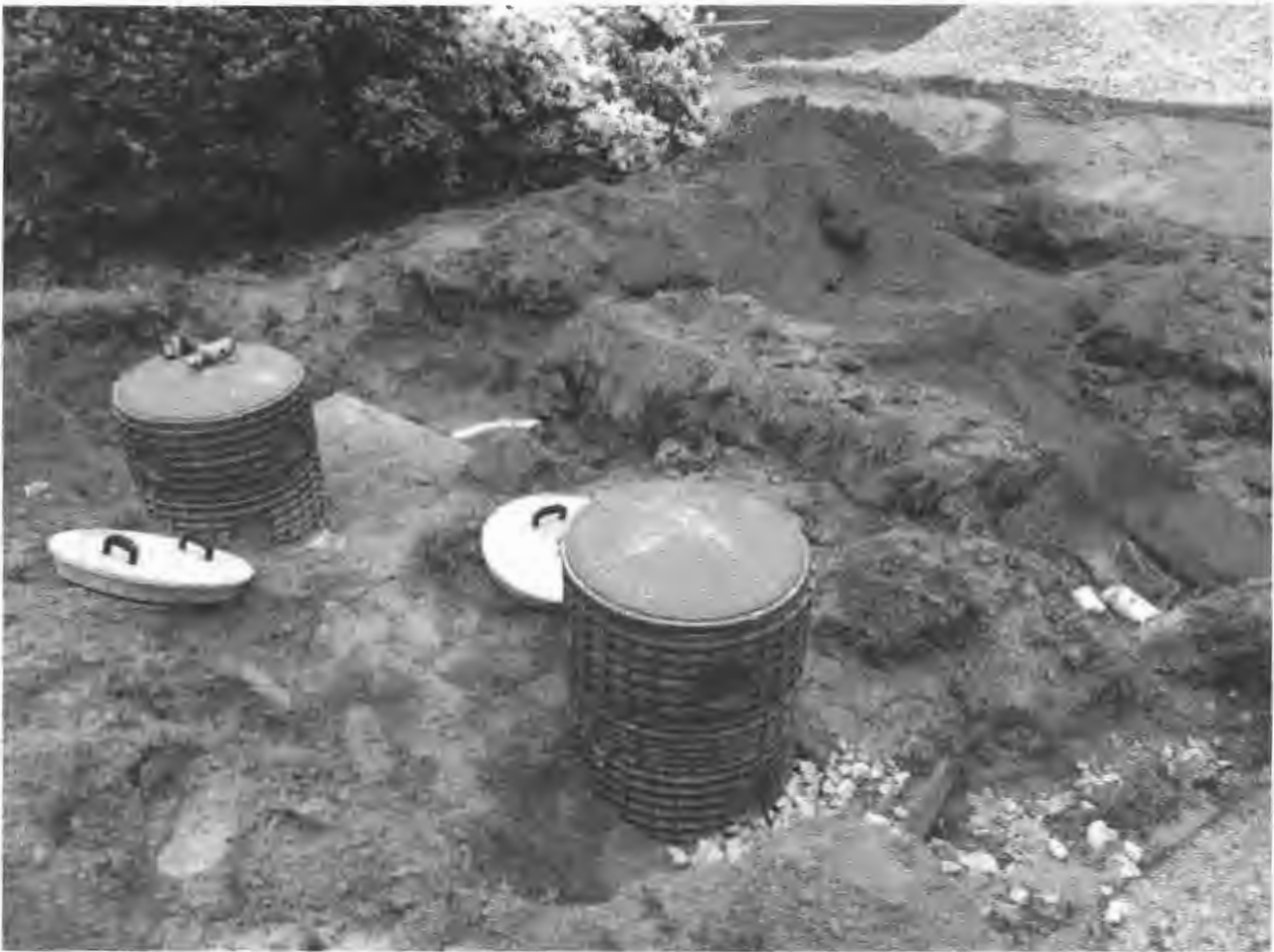
pic 5/1/19 new tank