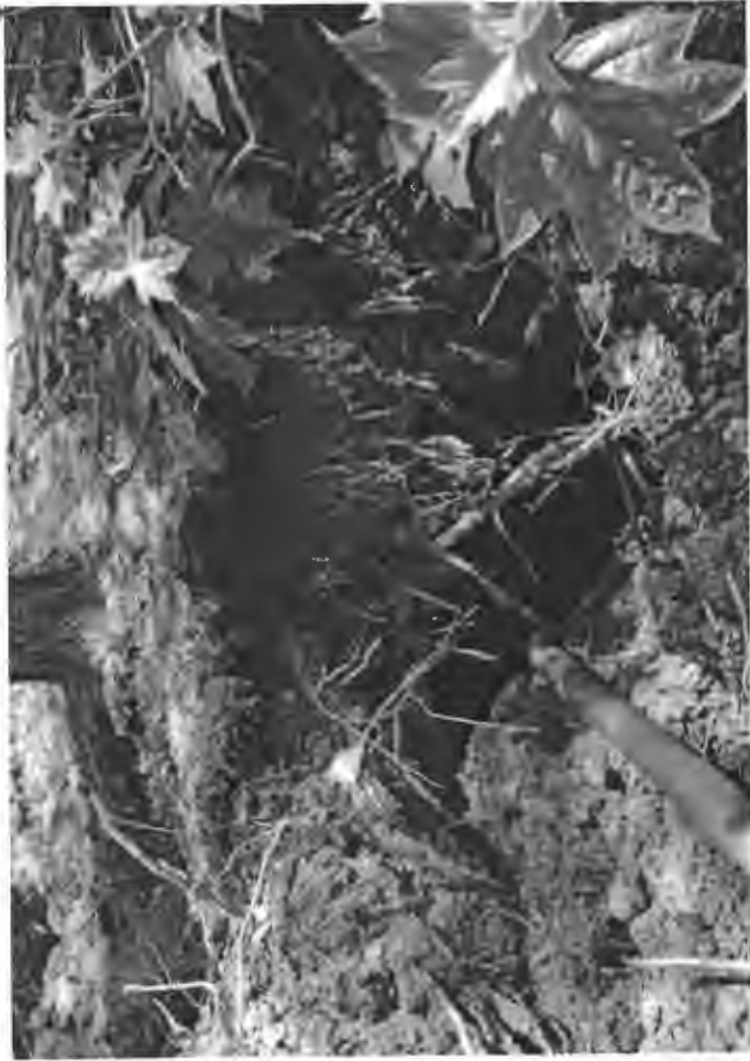
5/2/19 - Location of drywells - pumped & abandoned