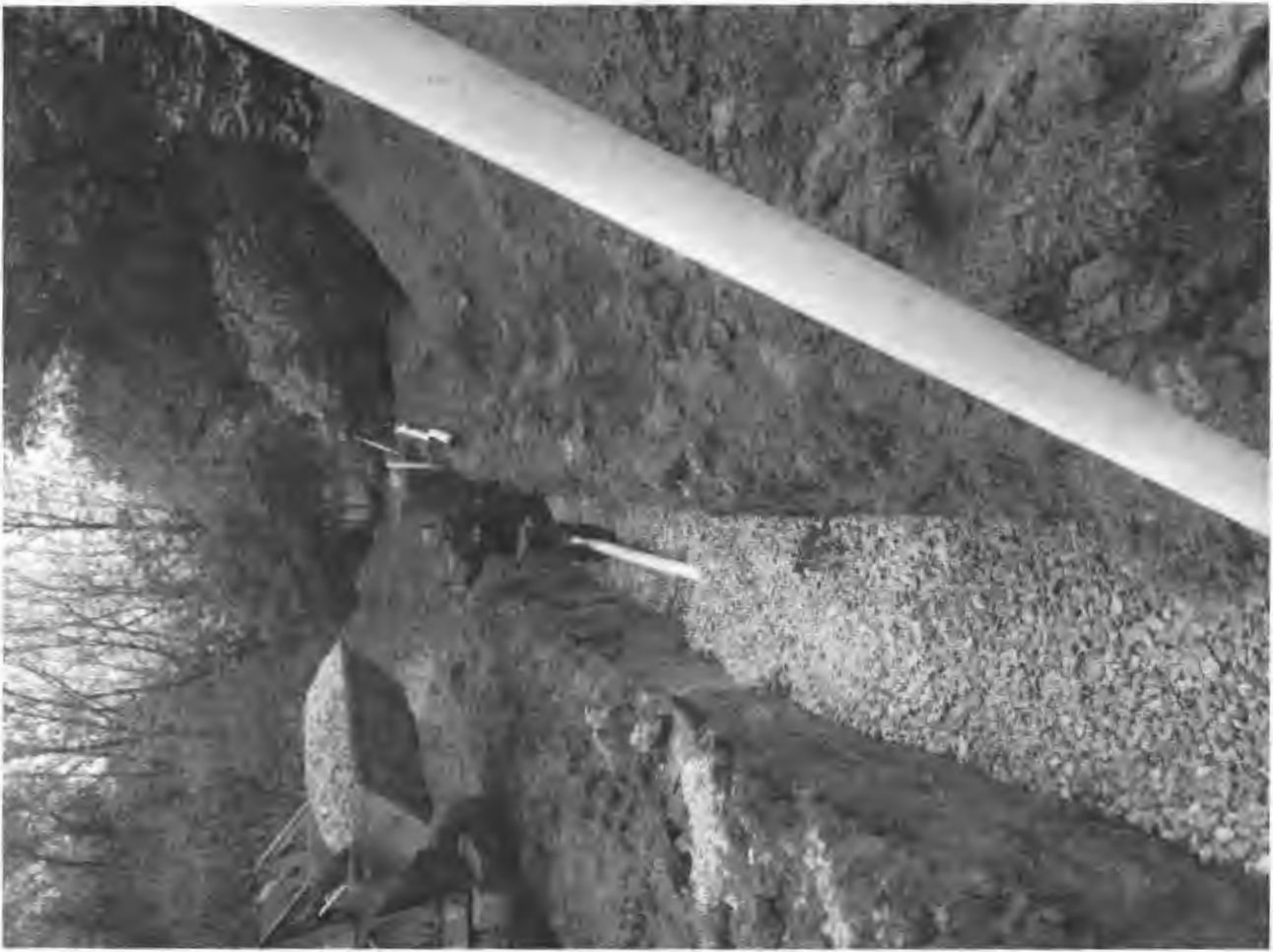
5/1/19 - Trench 1