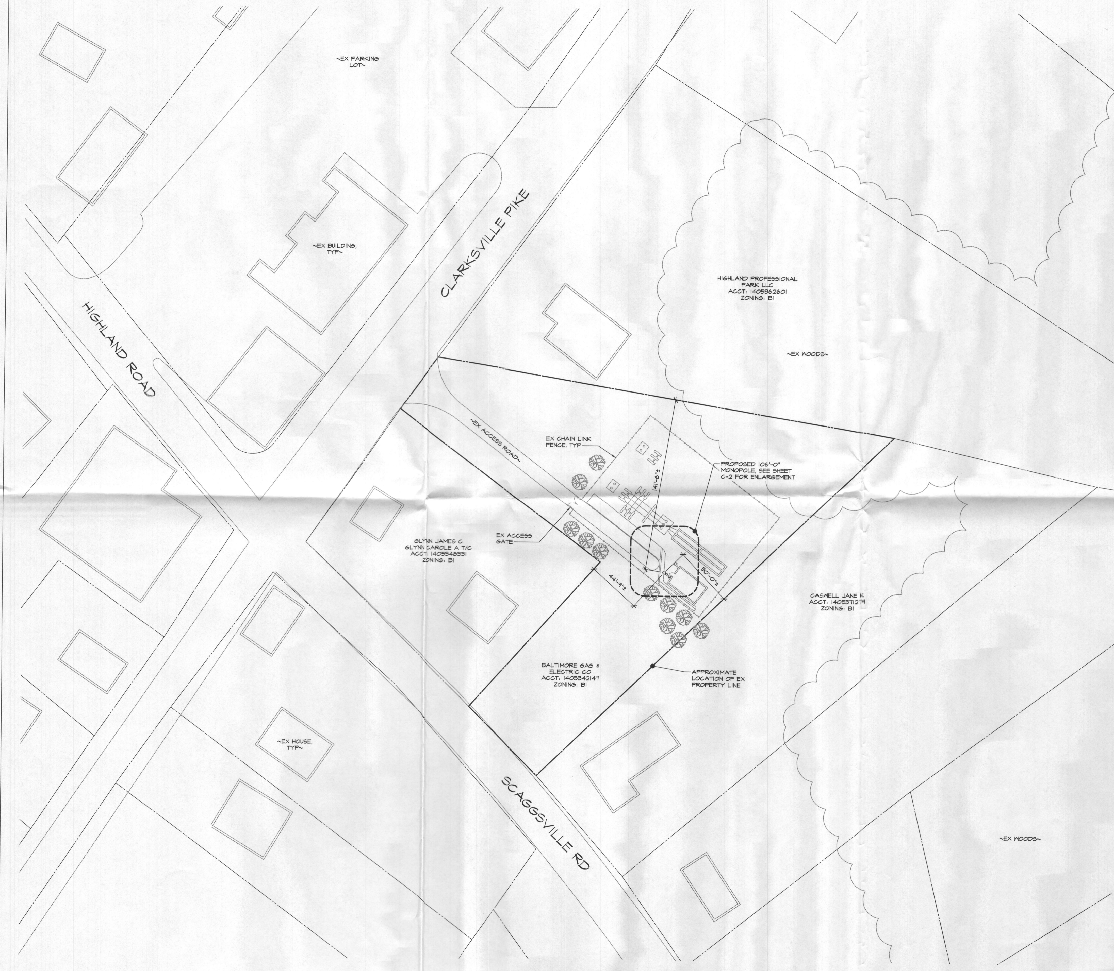
SITE PLAN SCALE: 1" = 40'-0"