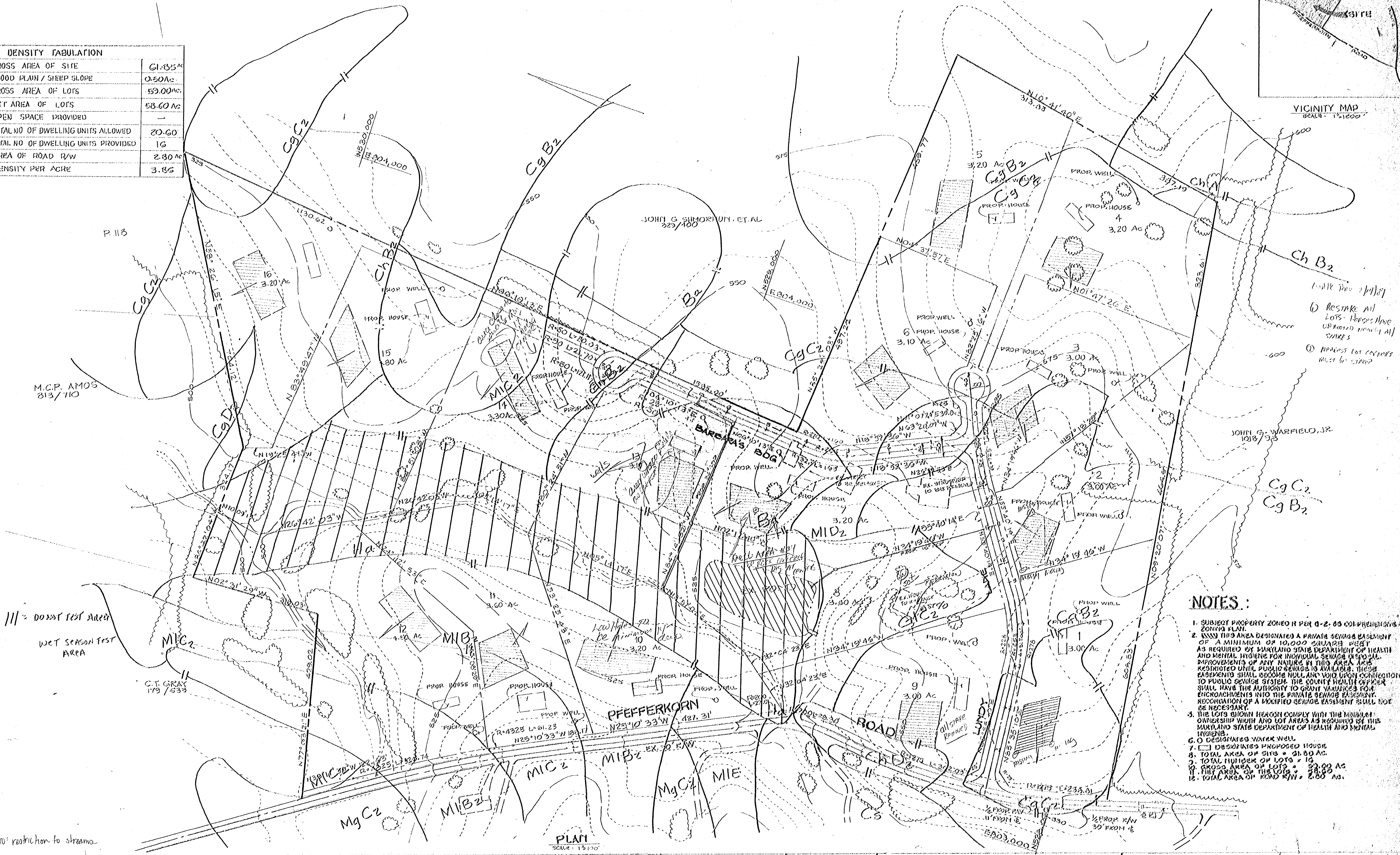
VICINITY MAP SCALE: 1/2" = 100'