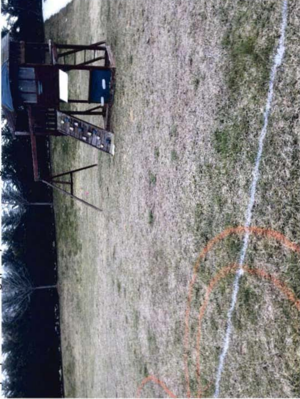
14370 Musgrove Farm Ct - 3/28/18 -flags for proposed building (pink) behind swing set