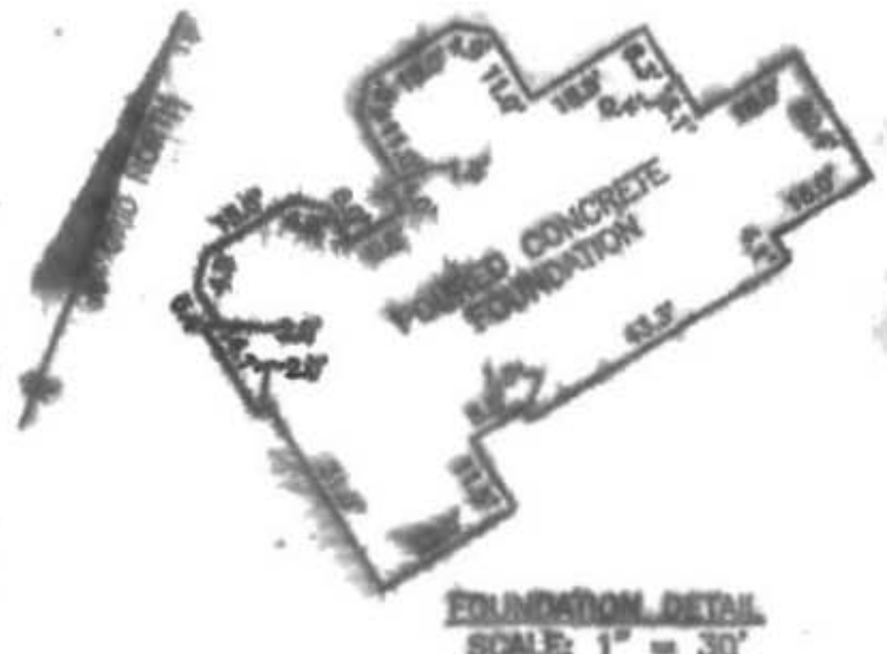
FOUNDATION DETAIL SCALE: 1" = 30'