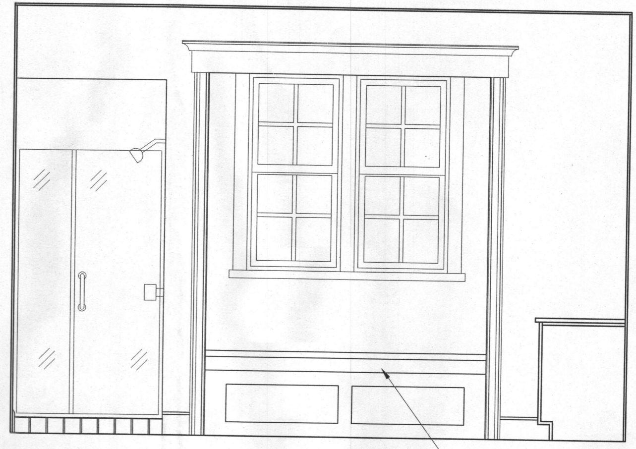
ID-1 Interior Elevation Master Bath

UNLESS OTHERWISE NOTED ALL INTERIOR PARTITIONS TO BE 3/2" UNLESS OTHERWISE NOTED WINDOW HEAD HEIGHT TO BE 1'-0" AS.F. UNLESS OTHERWISE NOTED PROVIDE 2-2x6 POSTS BETWEEN ALL MULTIPLE WINDOWS.