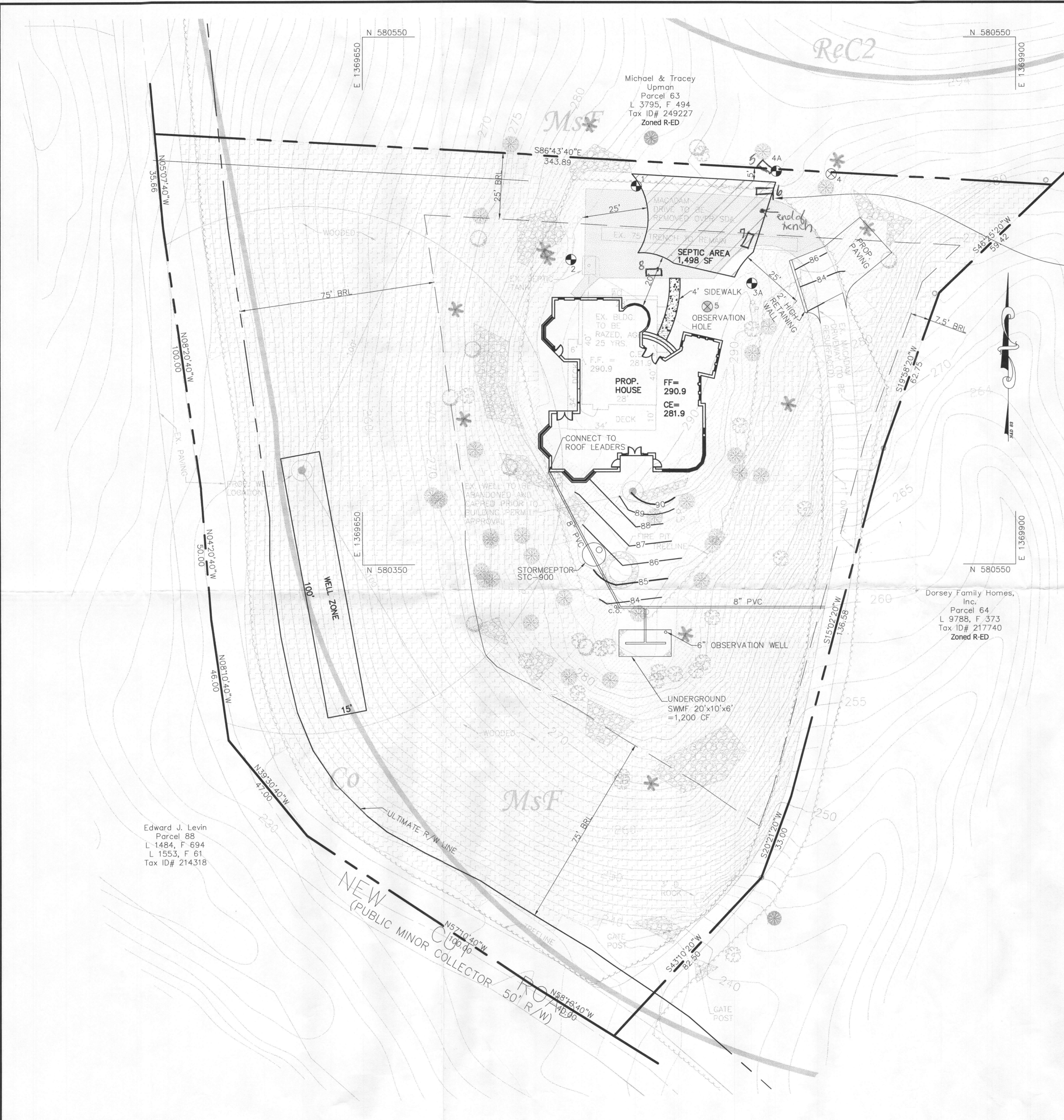
Perc. Chart (4 Bedroom Max.)