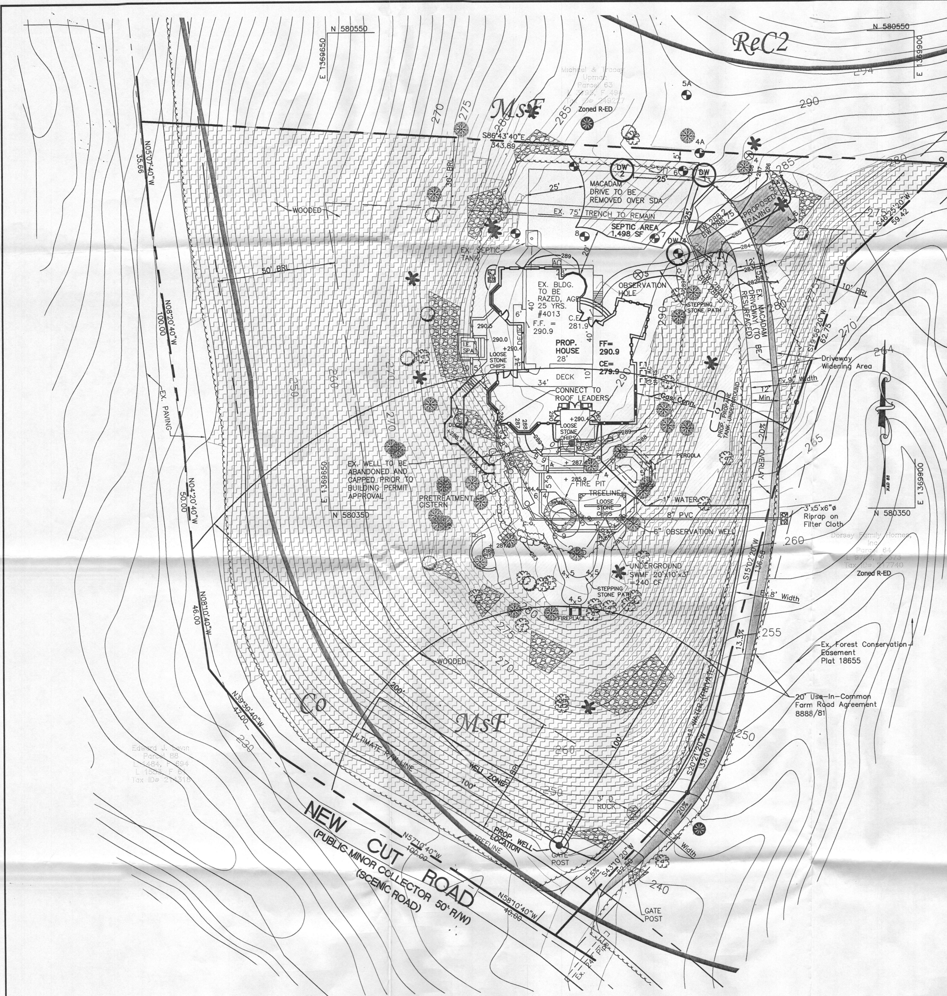
Perc. Chart (3 Bedroom Max.)