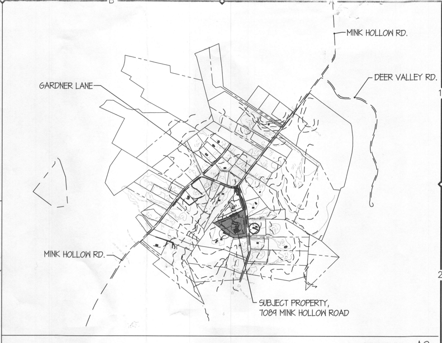
LOCATION PLAN A2