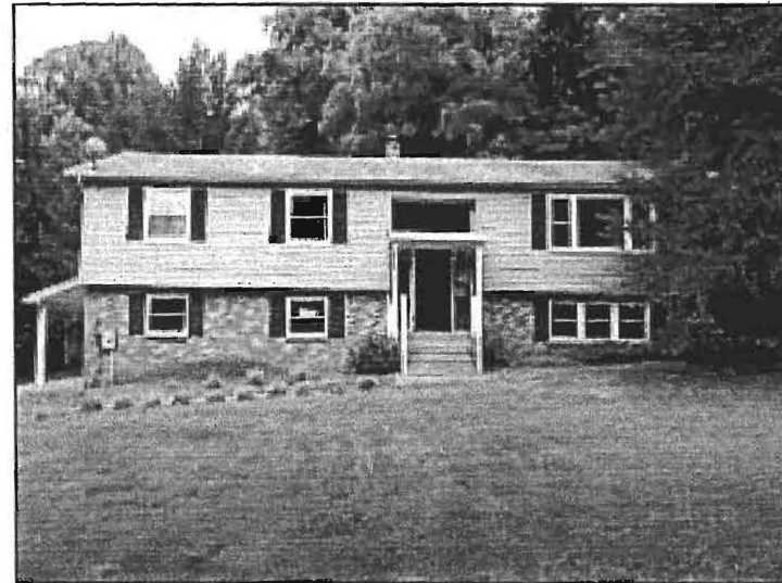
13777 Brighton Dam Road Clarksville, Maryland 21029