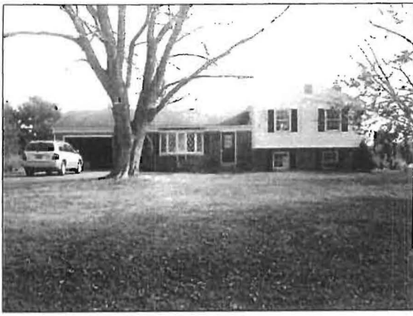
FRONT VIEW: #1213 ADGATE COURT