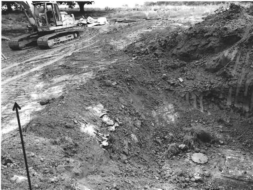
Site of former house

During demo, Mark Slowinski found a septic tank 13' deep, About 12' from garage of former house Sewer line came out under footer of garage 15" terra cotta cleanout Cast iron plumbing inside house, terra cotta outside Fogle's will pump tank 7/16/15