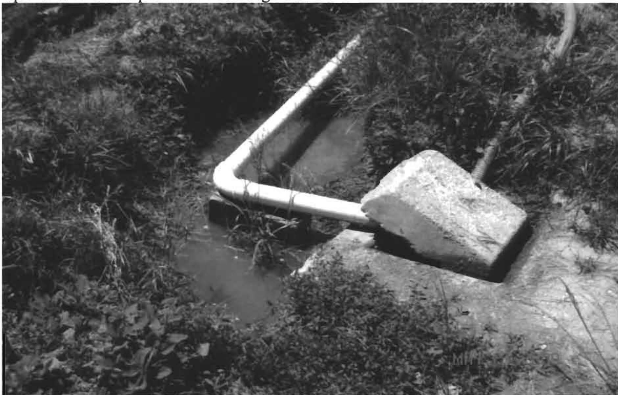
Septic overflowing with pump to discharge overflow onto the ground in the pasture.