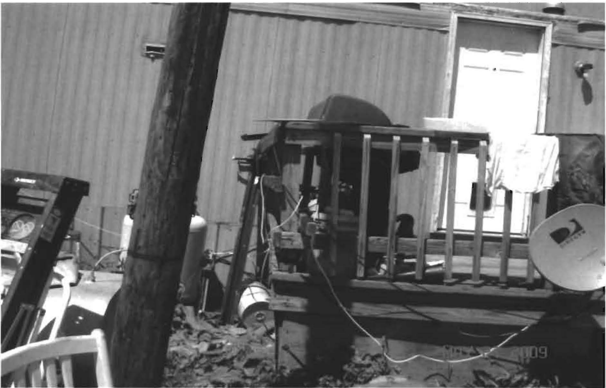
Junk all around the perimeter of the mobile home.