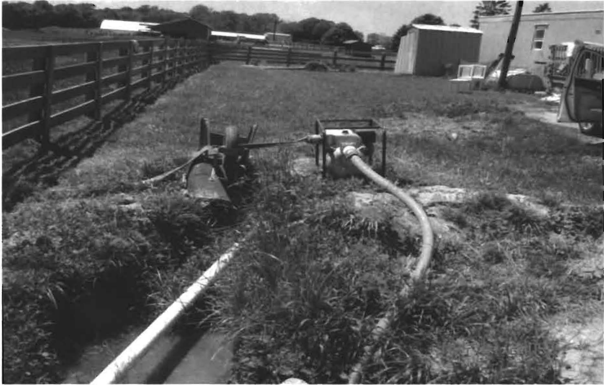
White septic line is believed to be coming from the mobile home. Pump to push overflow into the pasture past the fence.