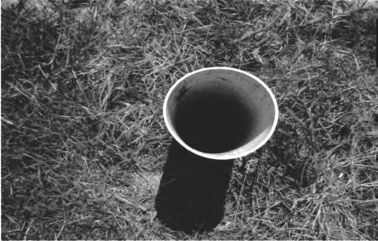
Open cleanout for septic. Full to running over.