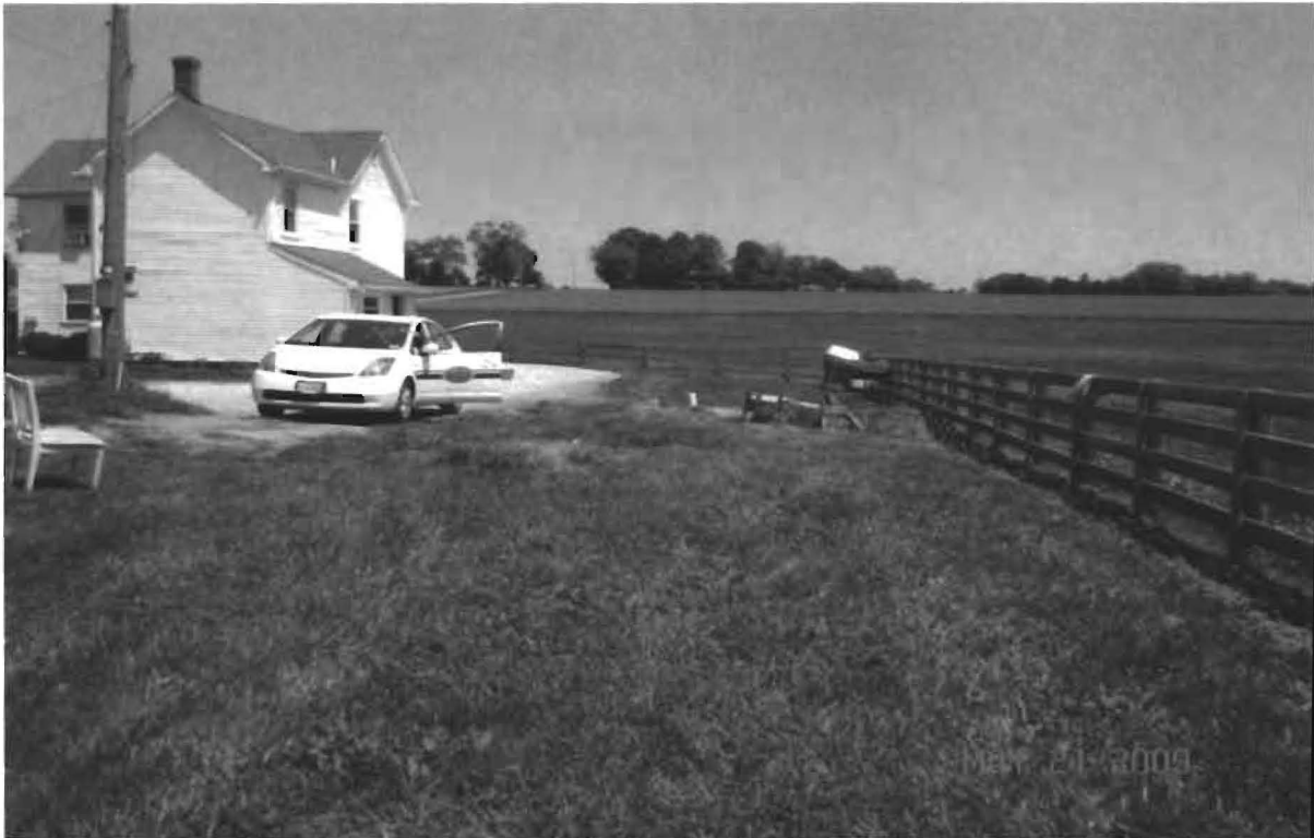
Septic to the right of the car. Pump to push overflow into the pasture.