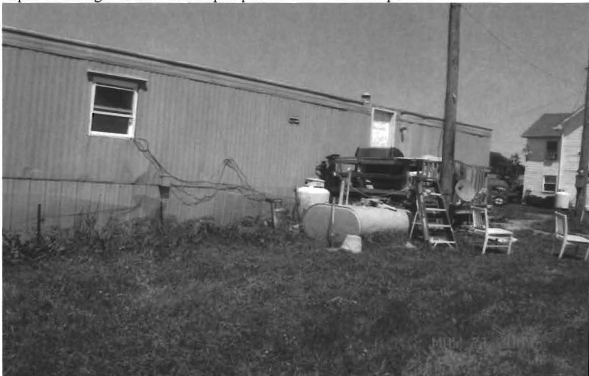
Junk all around the perimeter of the mobile home.