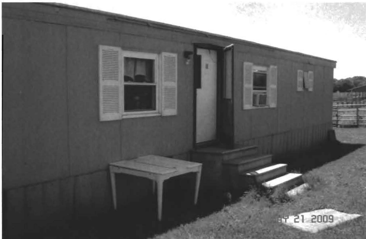
Storm door in disrepair.

12775 Old Frederick Road T00003465 Photos from May 21, 2009