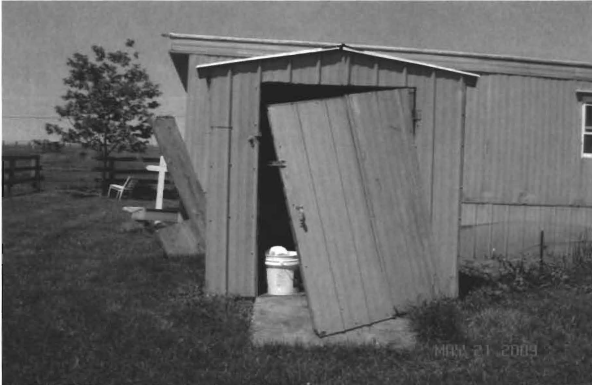
Shed in disrepair.