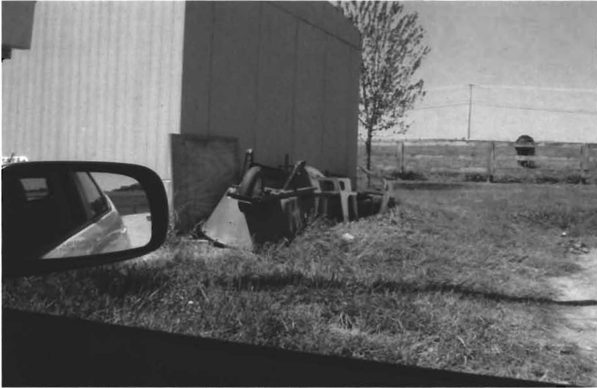
Junk all around the perimeter of the mobile home.