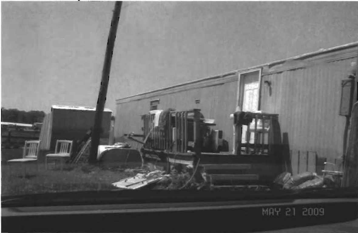
Junk all around the perimeter of the mobile home.