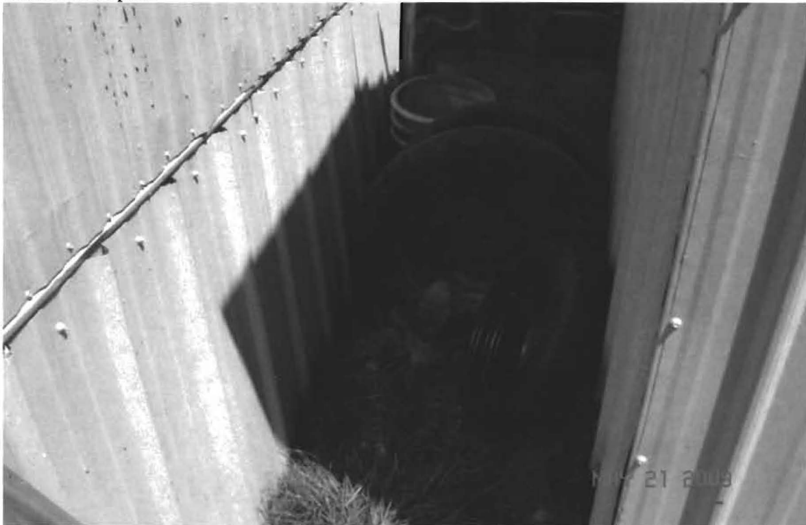
Junk tires stored behind shed beside mobile home.