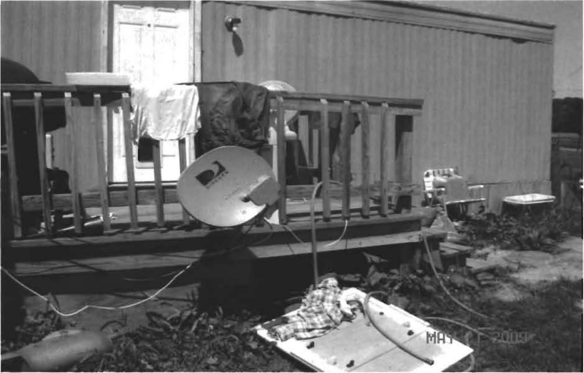
Junk all around the perimeter of the mobile home. Deck railings in disrepair.