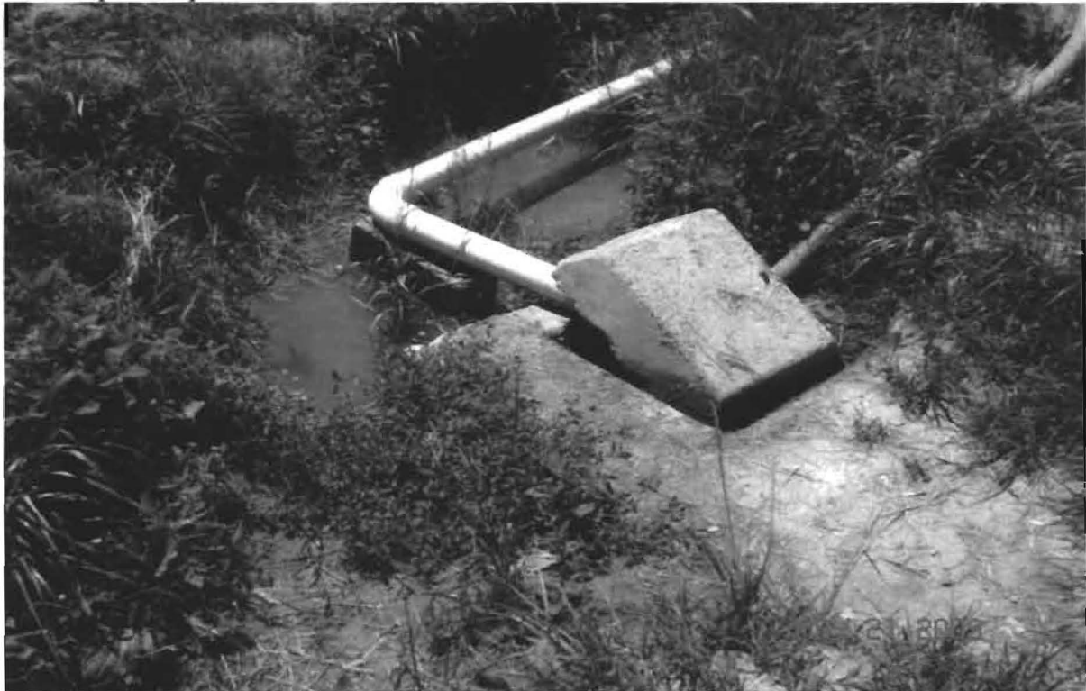
Overflowing septic tank with pump hose to discharge water into the pasture.