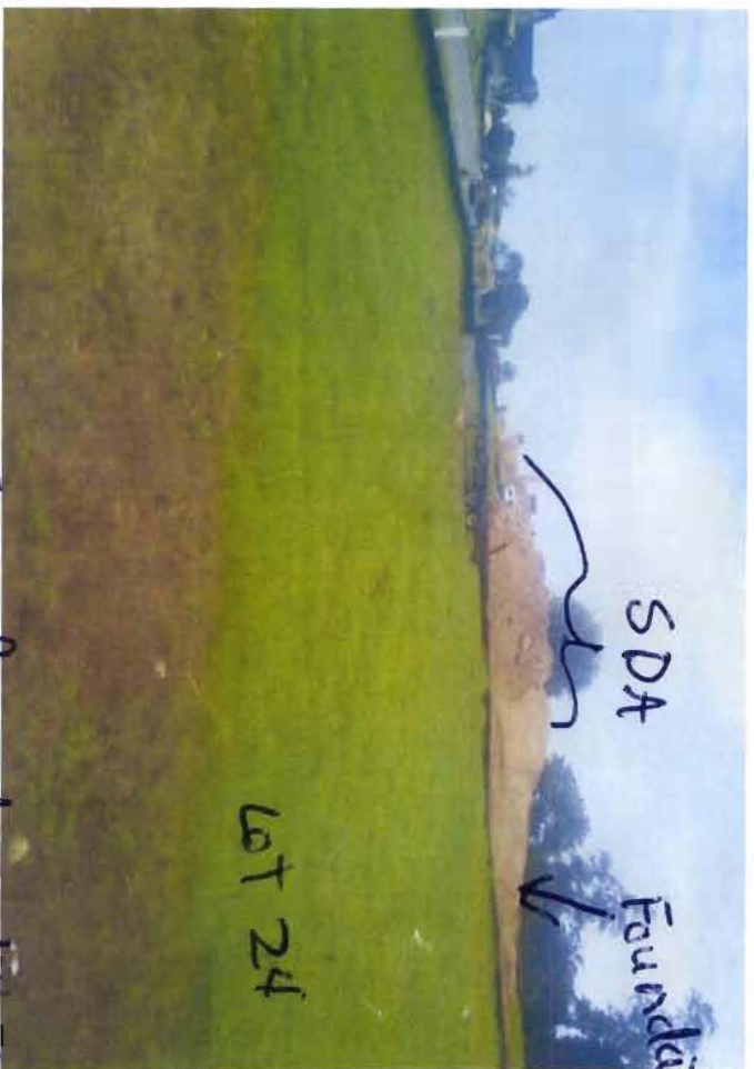
From Boundary Lots 24/25