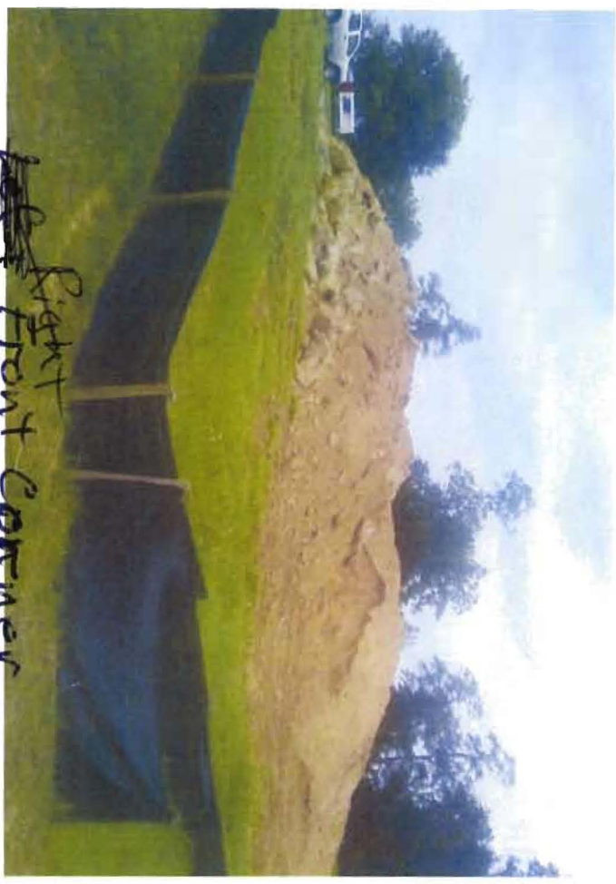
Left Right Front Corner