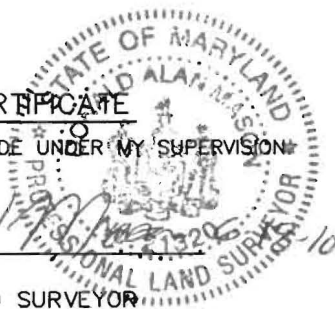
EXHIBIT TO ACCOMPANY A WALL CHECK